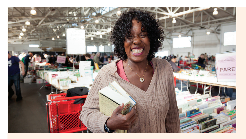
The largest used book sale on the West Coast! 500,000+ items for $3 or less.

The Big Book Sale is to book lovers as a grape harvest is to Dionysus." Chronicle Books